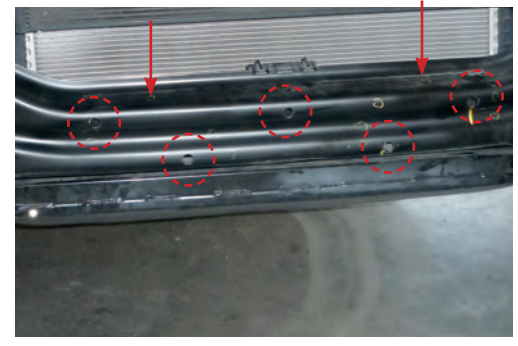
7 x Holes will need to be drilled to 12.5mm in front cross member

9. Place chassis bracket in position on chassis and mark location of all mounting holes onto front cross member. Remove chassis bracket and drill all holes to 12.5mm.