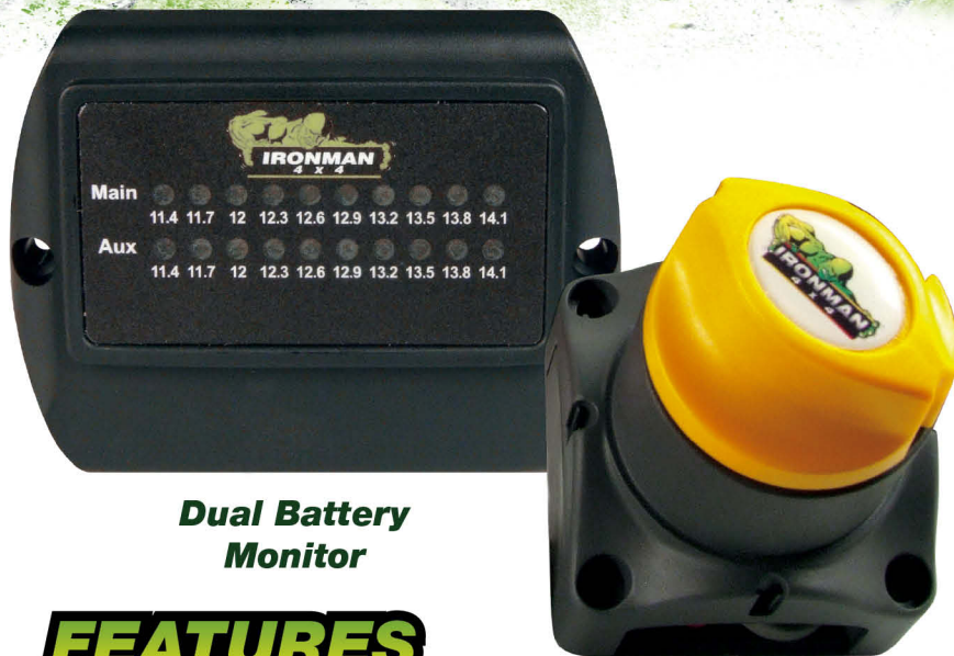
Dual Battery Monitor