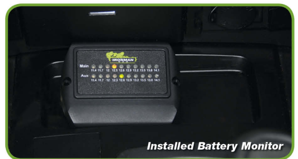
Installed Battery Monitor

The Ironman 140 Amp Dual Battery Kit eliminates the possibility of draining the starting battery, as long as your accessories are connected to your auxiliary battery.