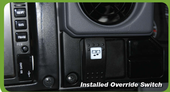
Installed Override Switch

Emergency Parallel Function: The Ironman 275 Amp Dual Battery Kit allows the user to override the automatic function and link the two batteries together. This can be done by turning the yellow knob on the unit or by pushing the override switch located in the vehicle.